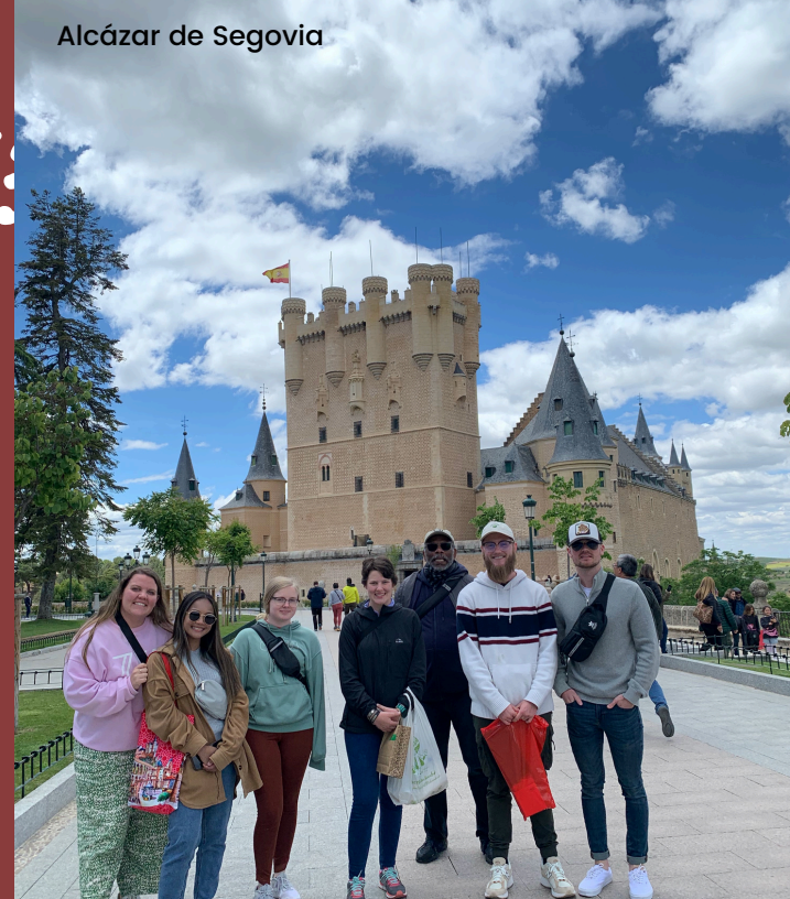
Alcázar de Segovia