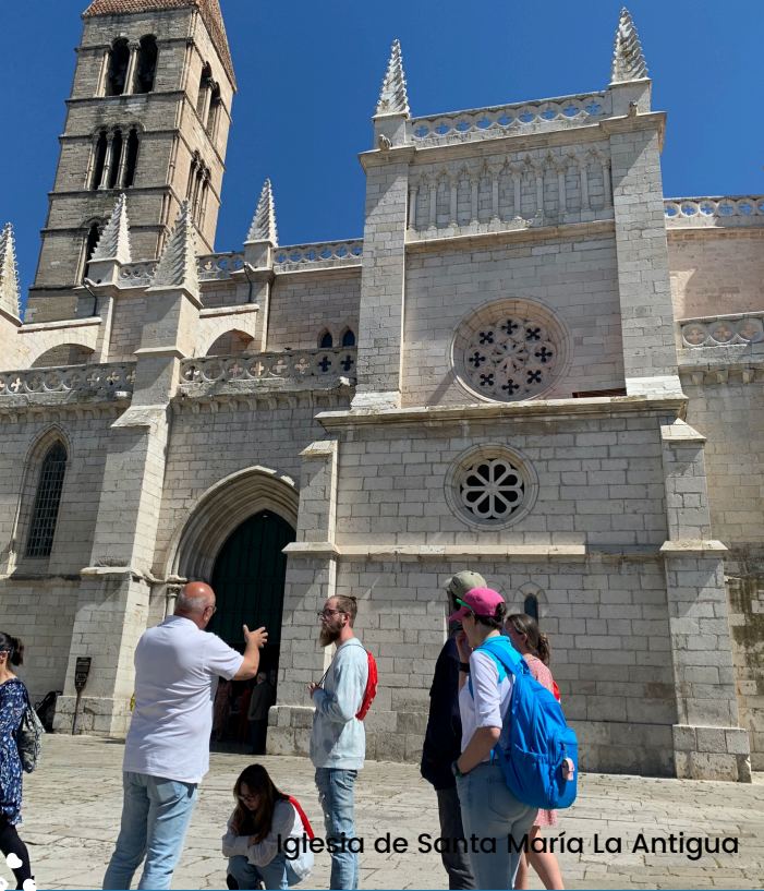
Iglesia de Santa María La Antigua