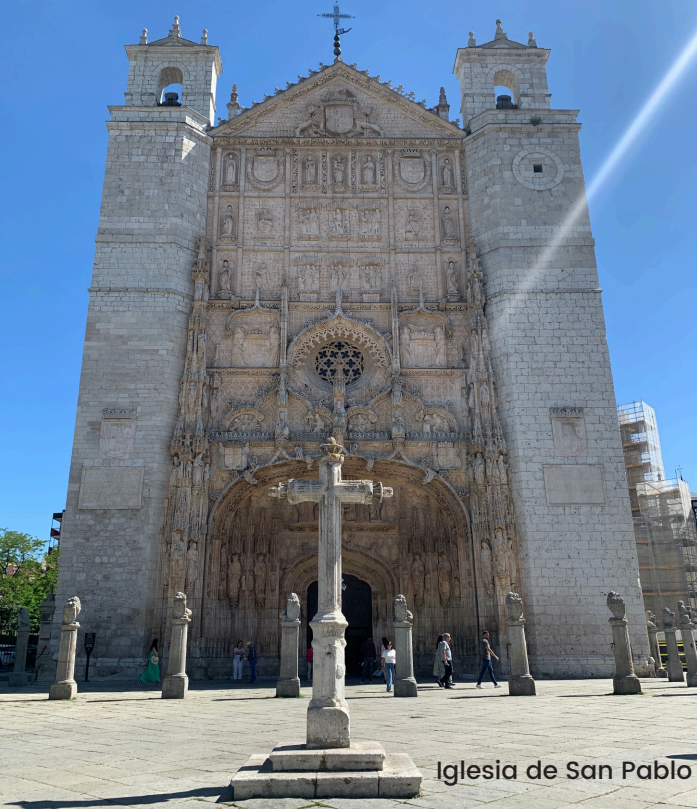
Iglesia de San Pablo