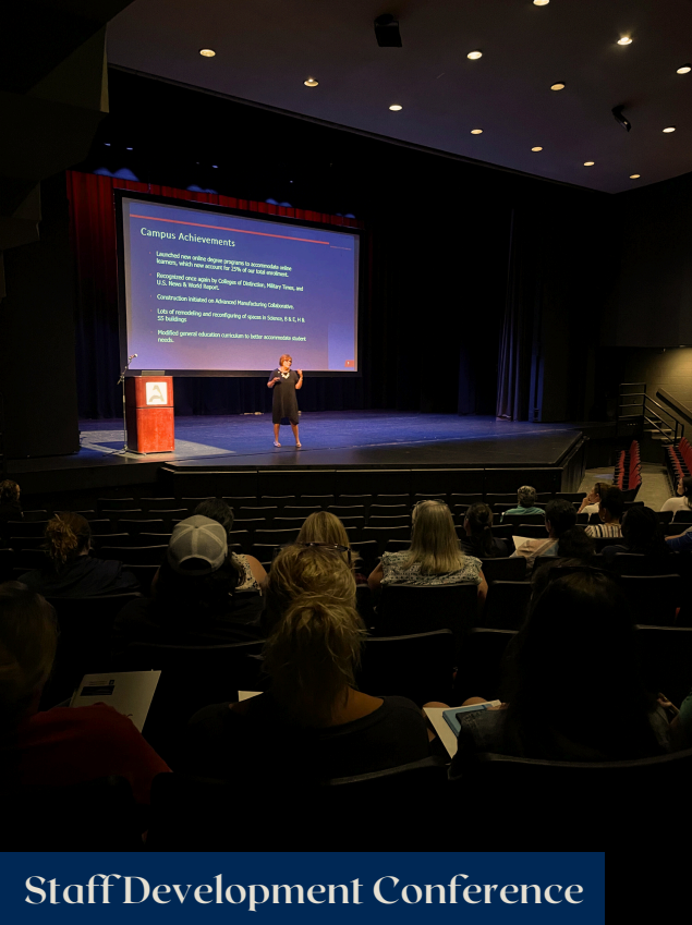
Staff Development Conference