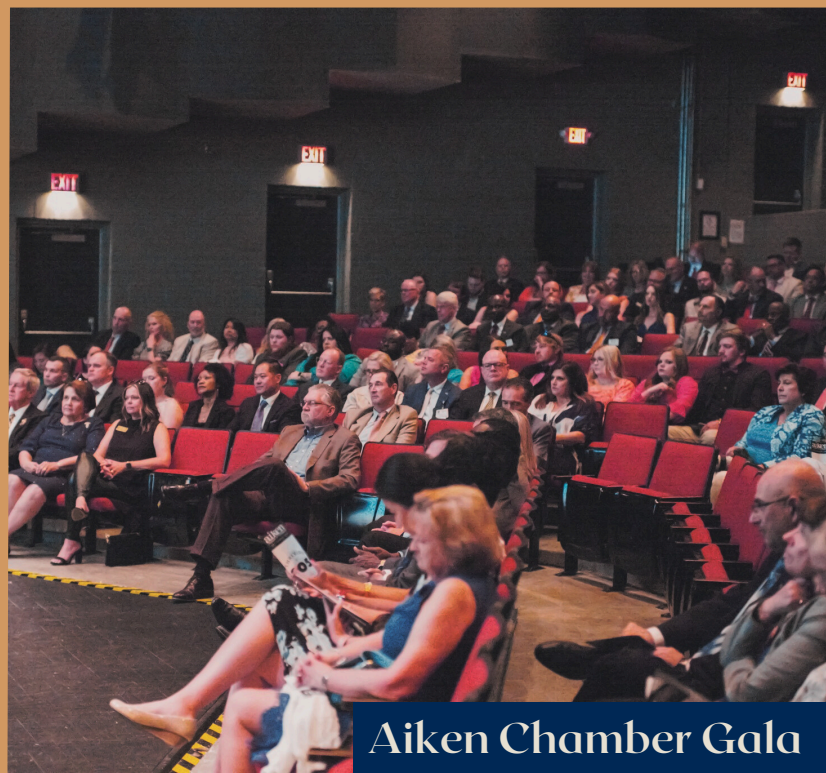
Aiken Chamber Gala