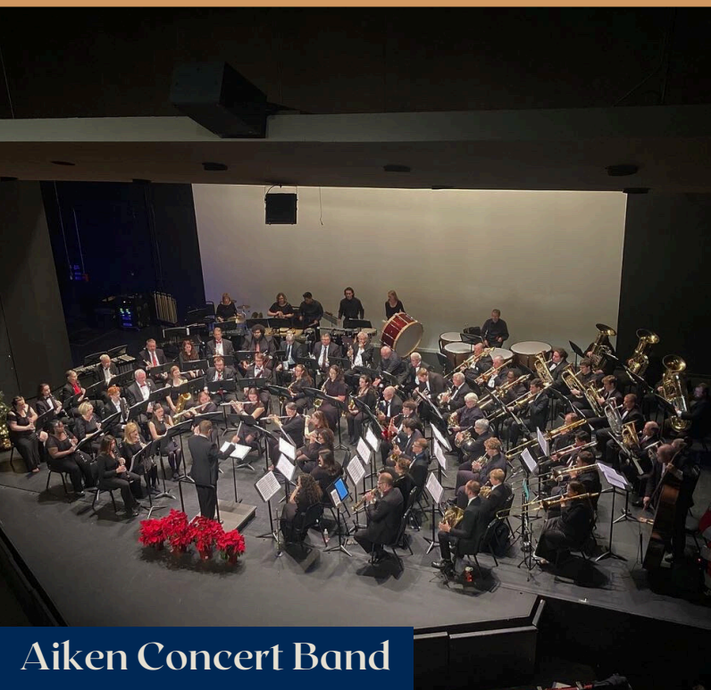
Aiken Concert Band