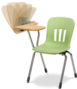
Classroom task chairs-Virco ANTASK18