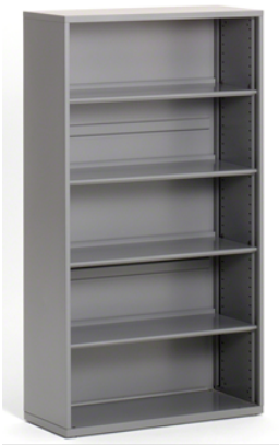
File cabinets – Virco #RWV30154AF – vertical file