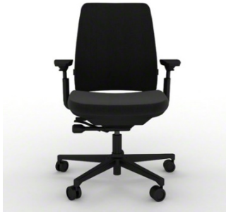
Desk Chair Alternate – Virco Jack #TS30324