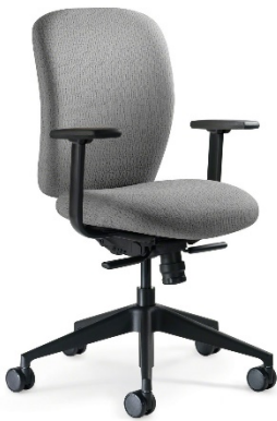
Guest chairs – Virco #475410M