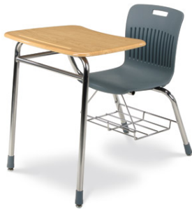
Classroom Tablet Arm Chair – Virco#ANTEL 1