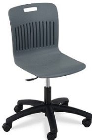
Classroom Lab stools – Virco #ANLAB